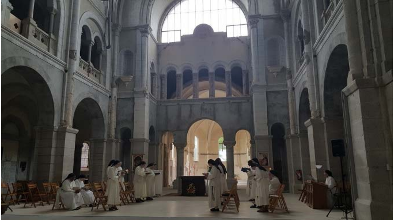
The current Basilica Our Lady of the Rosary in Prouilhe, France, where St. Dominic established his first group of cloistered contemplative nuns, converted back to the Catholic faith from the Albigensian heretics.

Below is a beautiful side altar to Our Lady before which the nuns sing the Salve Regina every night at Vespers.