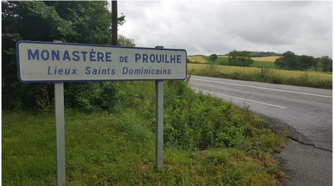
The location of the original Dominican Monastery of cloistered nuns established by St. Dominic at Prouilhe, in the Languedoc region of southern France.

Below is the Basilica of Our Lady of the Rosary and Dominican Monastery in Prouilhe. This location was an ancient pilgrimage shrine to Our Lady which St. Dominic restored and used as the cradle of his Order of Preachers.