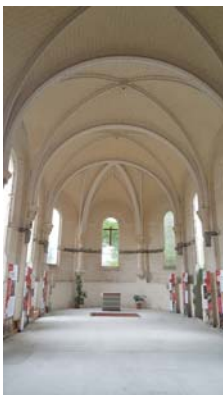
The current Basilica Our Lady of the Rosary in Prouilhe, France, originally established by St. Dominic and the spot where Our Lady gave the rosary to St. Dominic.

It was here that he established his headquarters, here where he founded his first community of cloistered nuns, and here where Our Lady, in the year 1208, first gave him the devotion of the holy rosary as his spiritual weapon to labor with her in the fight for souls.